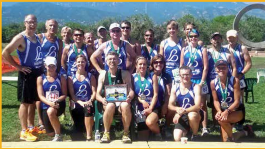
Colorado Springs Runners